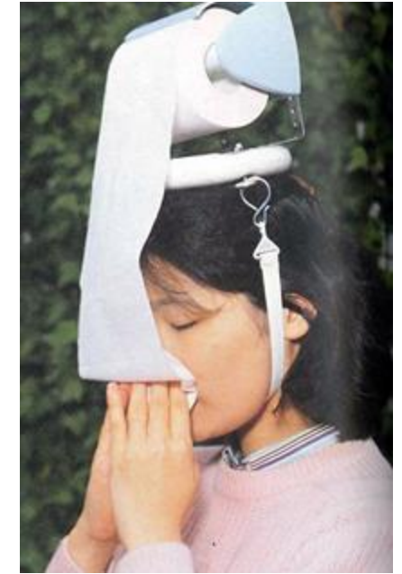
Toilet Paper Hat