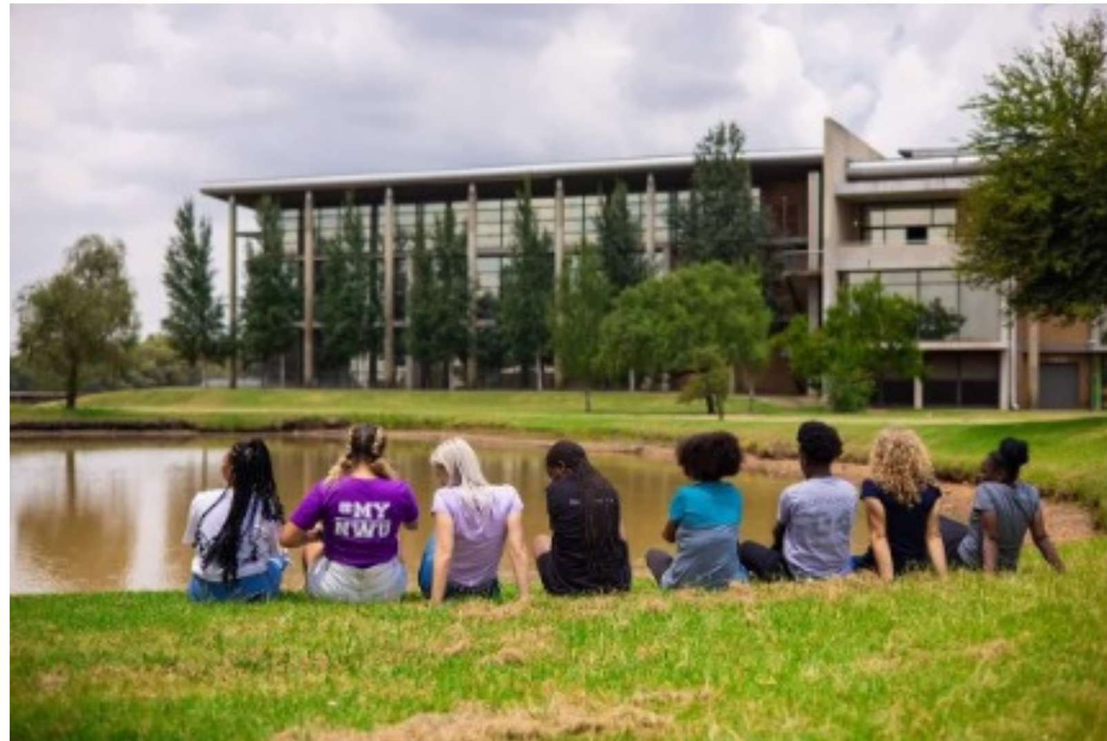
Taking a break after class on the Vanderbiltpark Campus

“Design, implement and evaluate a psychometric intervention based on a team needs analysis of an external client. Choose a team that will welcome team building, conflict resolution or any relevant team intervention. For this intervention, 3-4 people should work together as a group.”