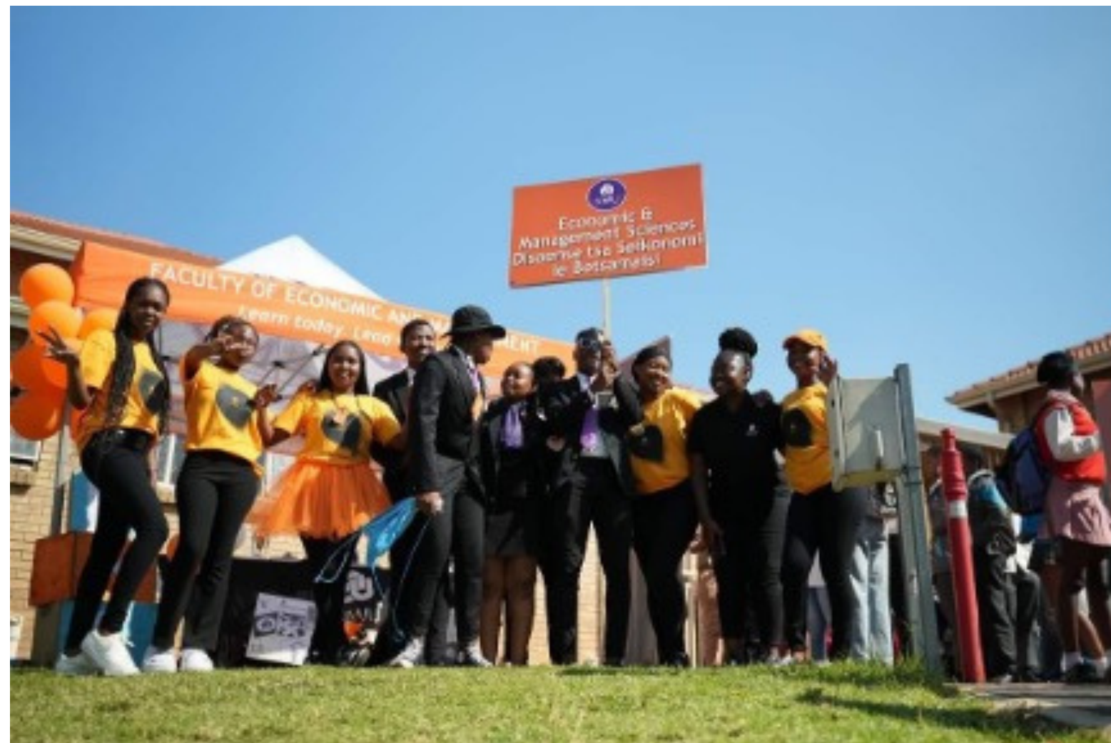
Faculty of Economic and Management Sciences Open-day for prospective new students