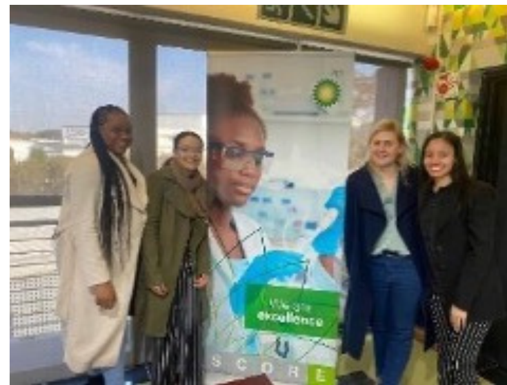
Students presenting intervention in-person